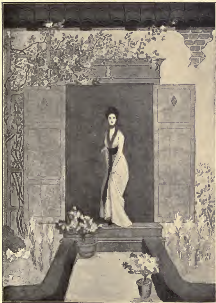
“ A LADY STOOD IN THE VINE-COVERED DOORWAY.”